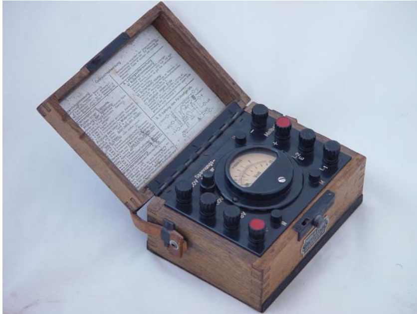
Figure 222: Feldmesskaestchen

For basic fault finding of telephone equipment and lines, the Feldmesskästchen was useful tool. The tester could measure voltage and resistance. For resistance testing, the field tester held a 4.5 Volt battery in the bottom compartment. An instruction shield in the lid describes how the instrument can be used to test batteries, measure resistance and test telephone lines. Build in a sturdy wooden box with metal bottom and top protection, the instrument was clearly designed with rough field handling in mind.